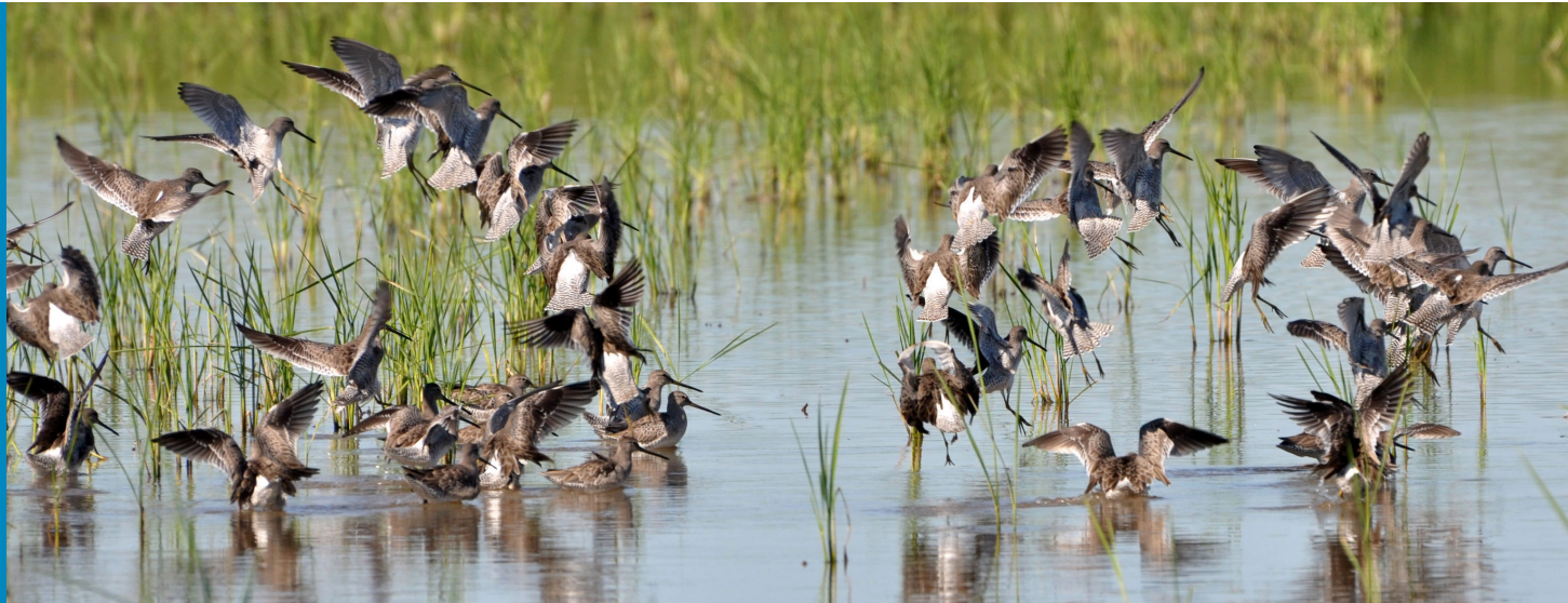
Migratory birds enjoy wetlands on private lands in the Gulf of Mexico.