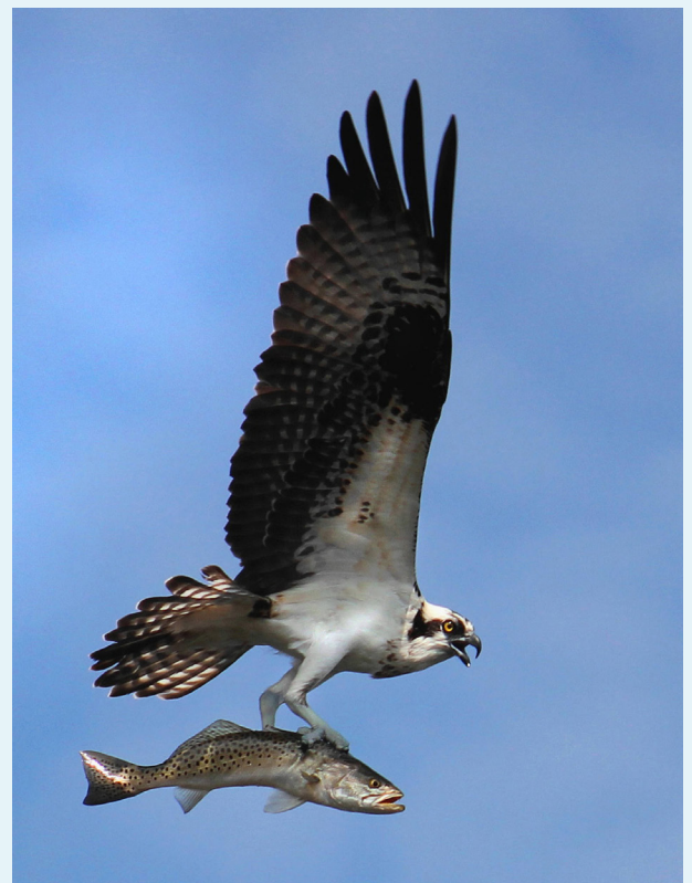
Osprey in flight with a spotted sea trout taken on Anna Marie Island in Florida (Gulf of Mexico).

These acres are within the three flyways passing through the Gulf of Mexico. These flyways are important corridors in spring and fall for millions of migratory birds because the Gulf States are the first and last lands encountered for trans-Gulf migrants. Additionally, the Gulf region's southern latitudes provide critical wintering habitat for significant numbers of waterfowl, wading birds, sparrows and other birds considered short-distance migrants who are escaping frozen waters and freezing temperatures farther north.