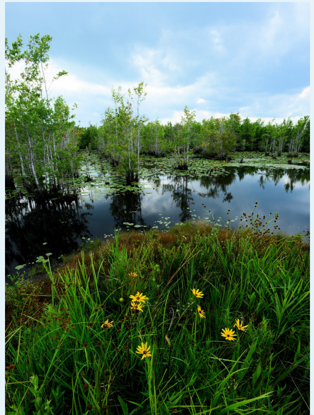
Plant life and vegetation thrive in wetlands and marsh areas along the Gulf of Mexico.

Private Lands Vision. NRCS and its state, local, and private conservation partners can build upon their combined capabilities and continue to collaboratively design and deliver barrier island protection and restoration projects, as well as coastal wetland restoration and freshwater introduction projects.