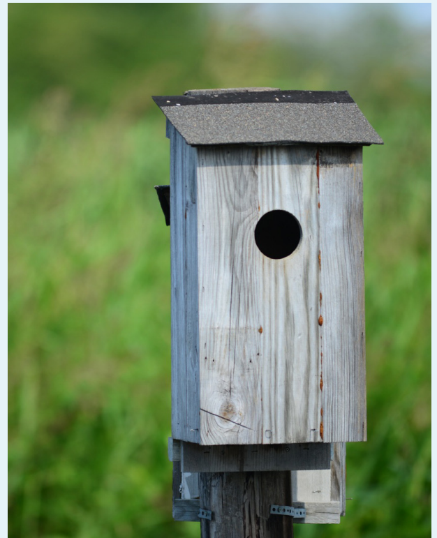
Wooden boxes in farm wetland provide a nesting habitat for wood ducks and other native water fowl.

Private Lands Vision. NRCS has extensive experience purchasing conservation easements and restoring floodplain lands along the Mississippi River and its tributaries. Coupled with other conservation priorities outlined in this document, investment to purchase and restore an additional 160,000 cropland acres will provide significant steps toward improving water quality in the Mississippi River floodplain and ultimately the Gulf of Mexico.